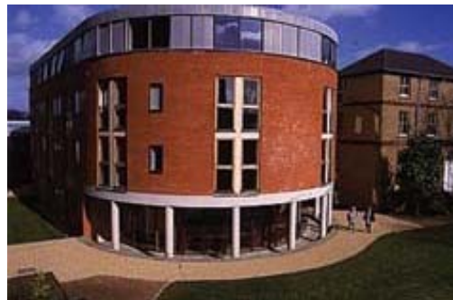
The Accommodation Building at Oriel College. 50 en suite study bedrooms available for delegates at much reduced rates

Since its inception, the college has produced many famous alumni such as the 15th century explorer Sir Walter Raleigh, Cecil Rhodes in the 19th century, and two Nobel Prize winners this century; Alexander Todd (Chemistry) and James Meade (Economics)